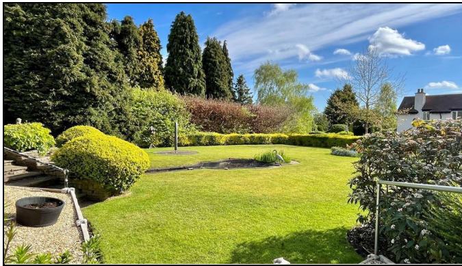
Riland Court, Penns Lane, B72 1AY